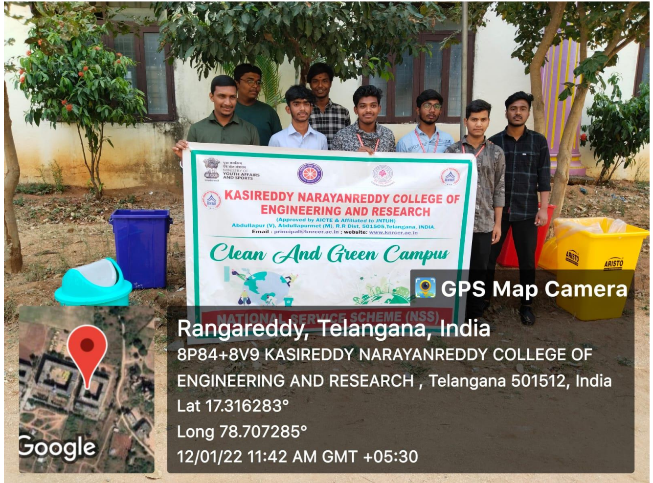
Clean & Green campus activity conducted at the campus premises

Email : principal@knrcer.ac.in ; website: www.knrcer.ac.in