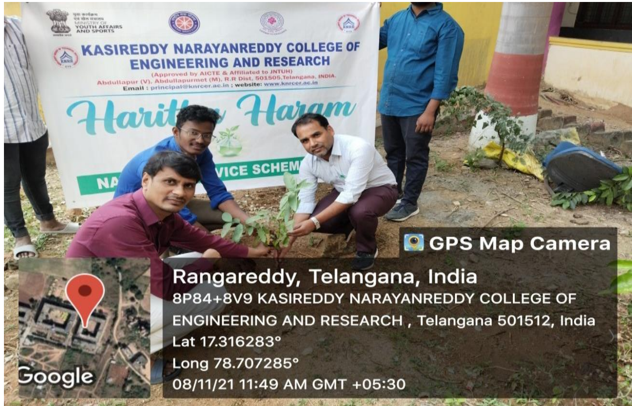
Haritha Haram Programme at our campus during 2021-2022

Many Programmes are conducted with respect to Green Campus Initiatives at KNRR Campus under the NSS Unit. Following are the sample pictures of such Programmes.