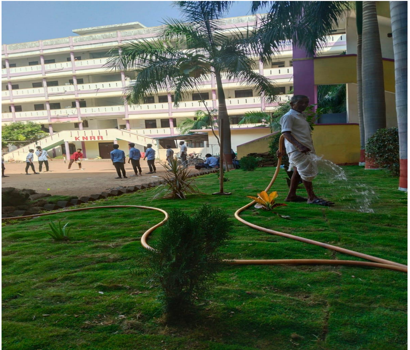
Frequent Watering of Plants at the Campus

Email : principal@knrcer.ac.in ; website: www.knrcer.ac.in