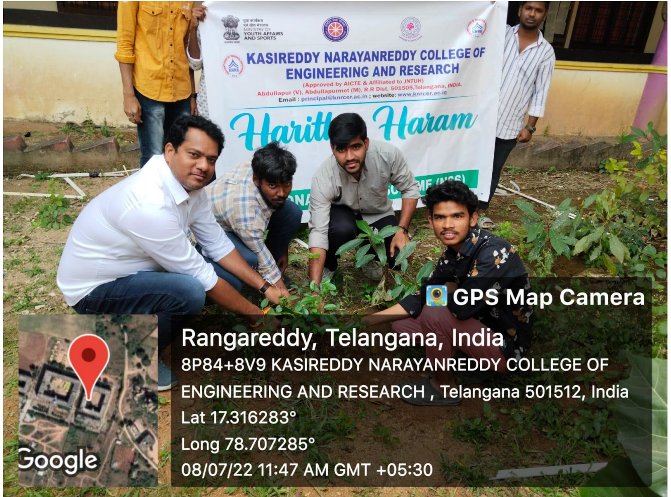
Haritha-Haram Programme conducted at the Campus

Email : principal@knrcer.ac.in ; website: www.knrcer.ac.in