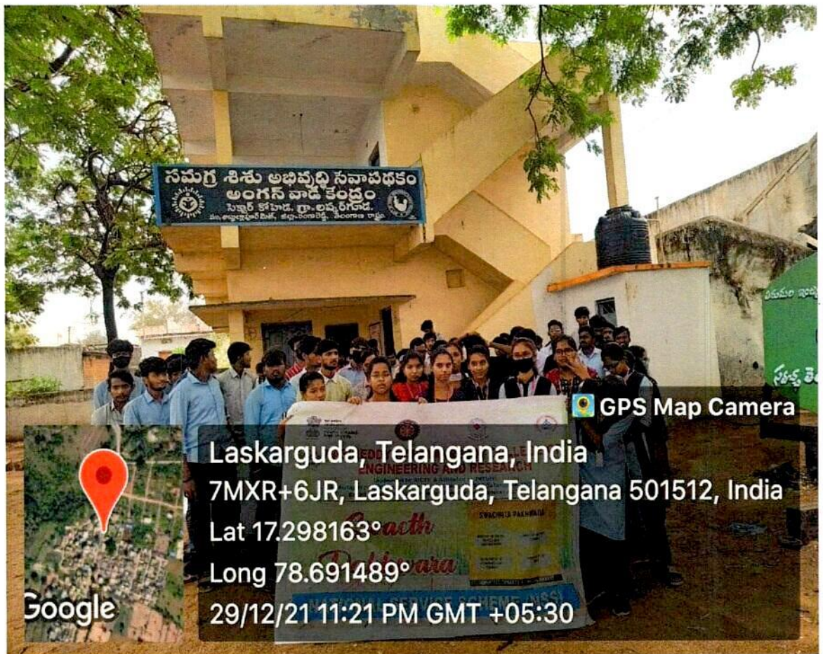
Swachhta Pakhwada at Laskarguda (A.Y 2021-22)

NSS unit of our KNRR has conducted Swachhta Pakhwada on 29 th of December 2021, at Laskarguda Village. For this Programme around 100 students are Participated. Swachh Pakhwada is about Cleanliness and it is introduced by Government of India in the Year 2016. This Programme is conducted to create awareness & importance of Cleanliness of the Surroundings to Villagers. Following is the sample picture of Swachhta Pakhwada near the Anganwadi Centre, Laskarguda.