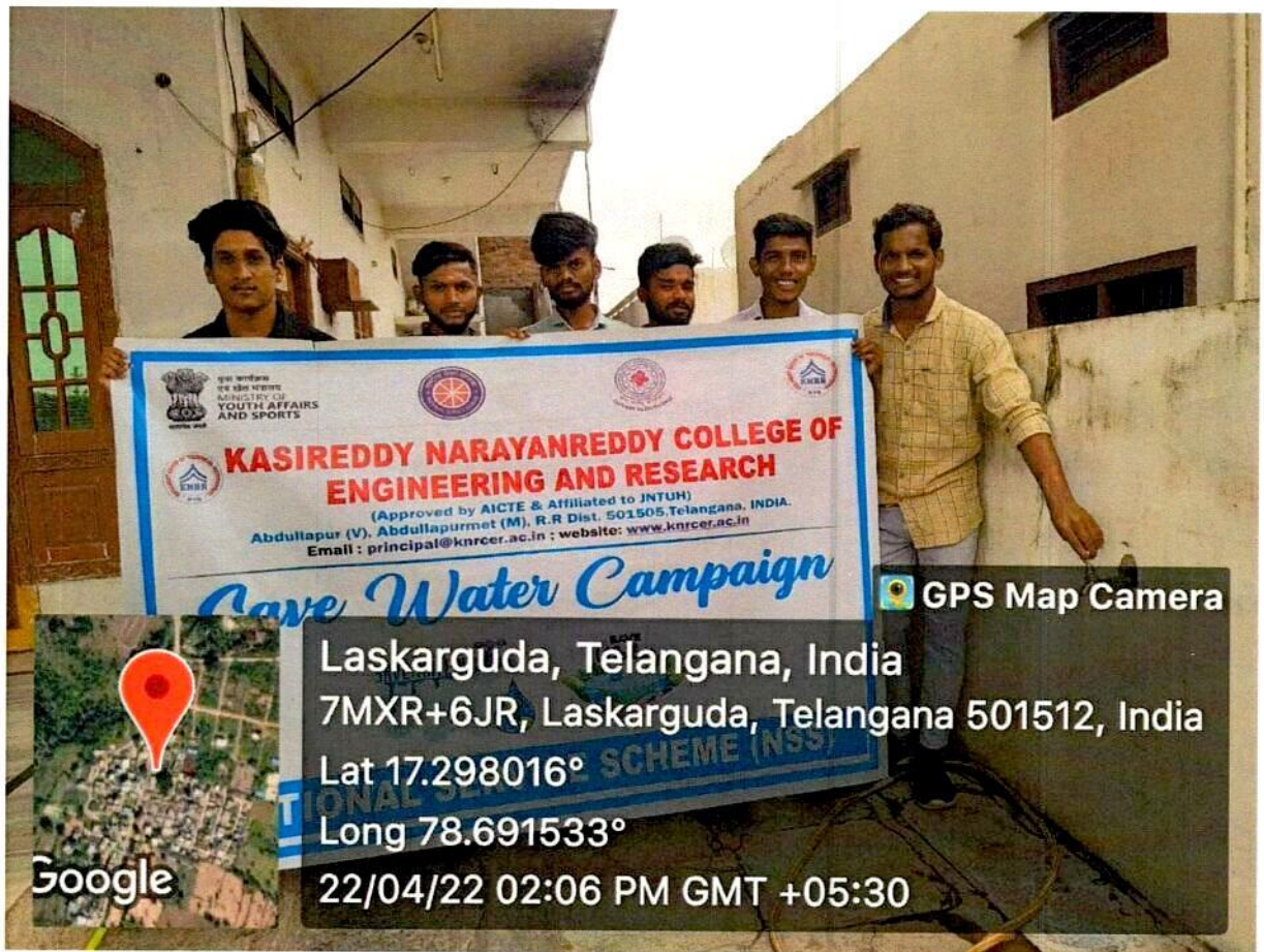
Save-Water Campaign by NSS Unit at Laskarguda (A.Y 2021-22)

This Public water conservation campaign raised awareness in all levels of society about the importance of saving water to cope with its scarcity and ensure sustainability. The aim is to change citizen attitudes and behavior to improve water use efficiency. This Programme is conducted by our NSS unit on 22 nd April 2022, near the Laskarguda to create awareness about water wastage & its effects. Around 50 students have participated in this activity to make it successful by creating awareness door to door. Following is the sample picture of Save-Water campaign at a Residential Building at Laskarguda.