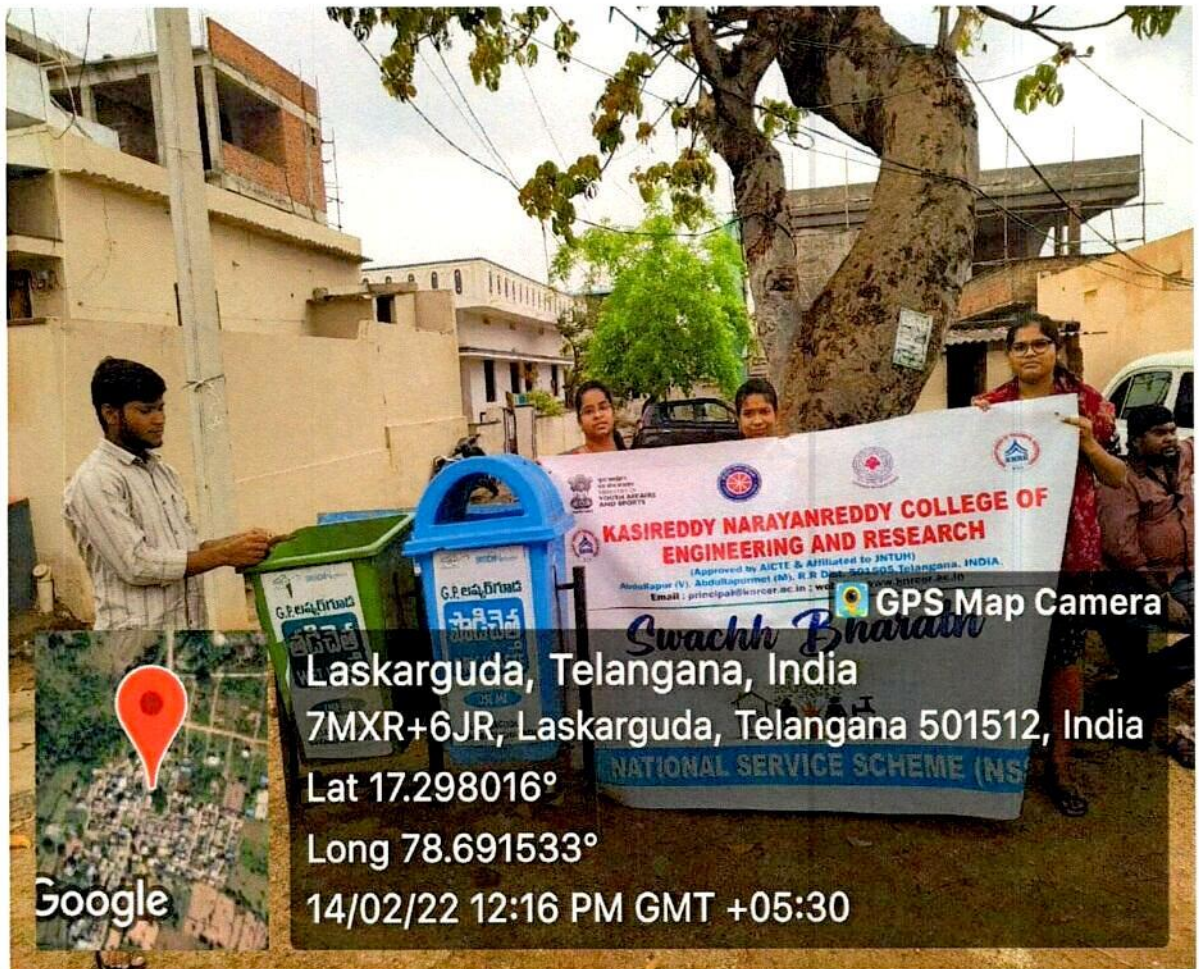
Swachh Bharat at Laskarguda (A.Y 2021-22)

KNRR with the help of NSS unit, has conducted Swachh Bharat Programme on 14 th February 2022. For this event around 150 students have participated. Swachh Bharat Mission has initiated by the Prime Minister of India & had launched on 2nd October 2014, to accelerate the efforts to achieve universal sanitation coverage and to put the focus on sanitation. Our Students have created awareness to the Villagers about the Swachh Bharat Scheme. Following is the sample picture of Swachh Bharat Programme conducted at Laskarguda.